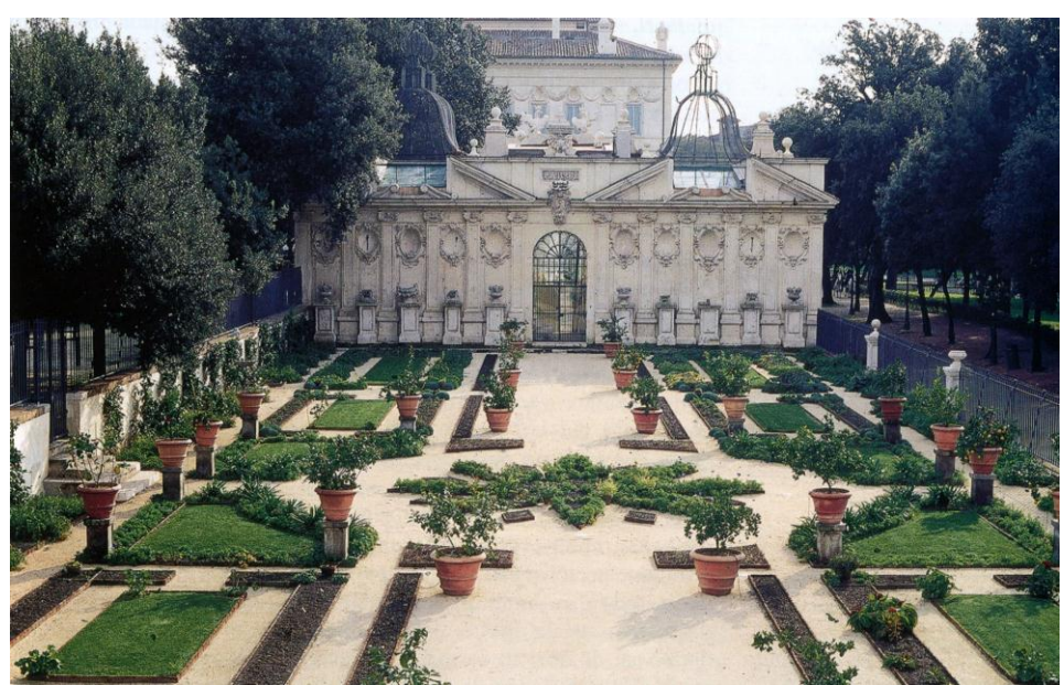
Villa Borghese, Rome